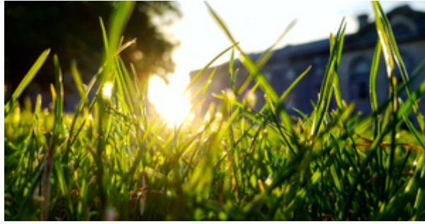
Isaac Souray 11S