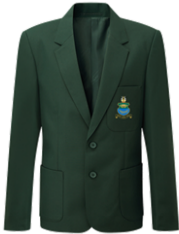
★ Green blazer £35 / £40