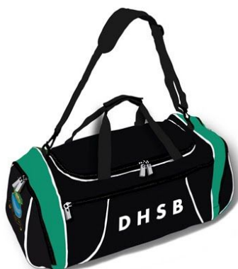
★ DHSB sports bag £32