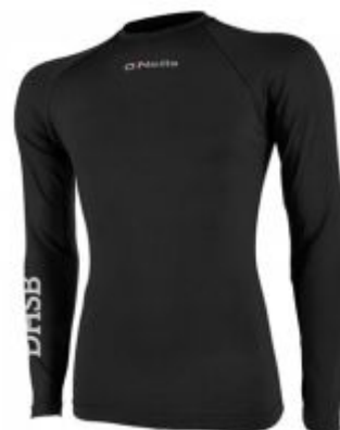
Baselayer £19 / £22