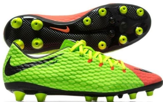
Football boots with round plastic moulded studs