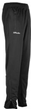
★ Durham skinny track trousers £26.50 / £32.50