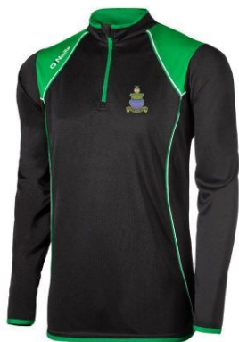
★ Half zip training top £25 / £33