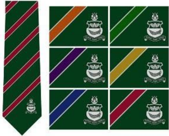
★ House tie £6.50