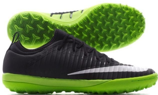
Astroturf Trainer (rubber sole with dimpled profile)