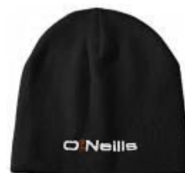
Beanie hat £7