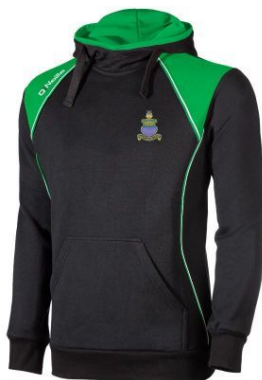
★ Hoody £25 / £33