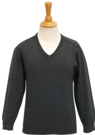
School charcoal jumper with embroidered badge £15.50 / £17 / £19