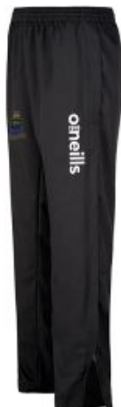
Kiwi regular track trousers £22 / £28