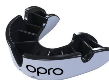
Opro Silver mouthguard (A mouthguard can be purchased from elsewhere) £11