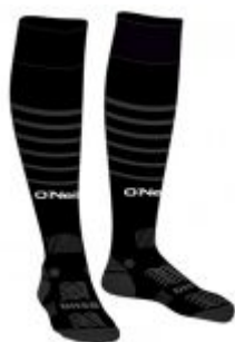
★ Sports socks £8 / £9

The shirts and shorts can be mix and matched with each other.