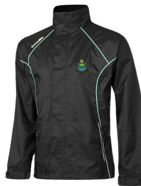
Rain jacket £25 / £30