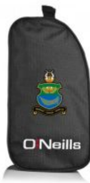
Boot bag £11