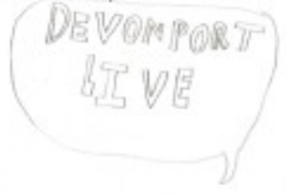
if graph to show the quality of your place in Devonport

Devonport Live is a cafe situated in the main part of Devonport, near the town. As a small cafe they have a small building opposite a road. However what they have built the community activities for it. As one of the first cafes here a policy where anyone is welcome to the cafe and anyone is asked. Allowing for the anyone can pick up for anyone else, the cafe gives their members and of happiness make someone day. As a whole the Devonport Live cafe is a very warm and welcome place.